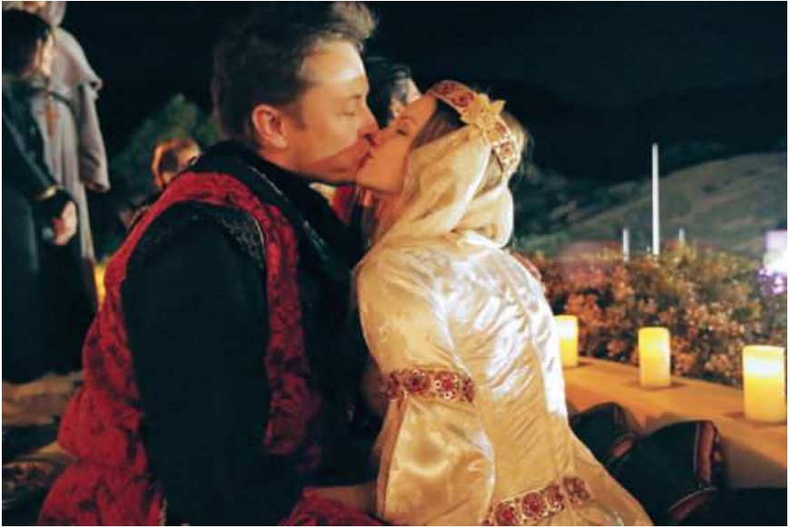
Musk married, divorced, remarried, and then divorced the actress Talulah Riley.