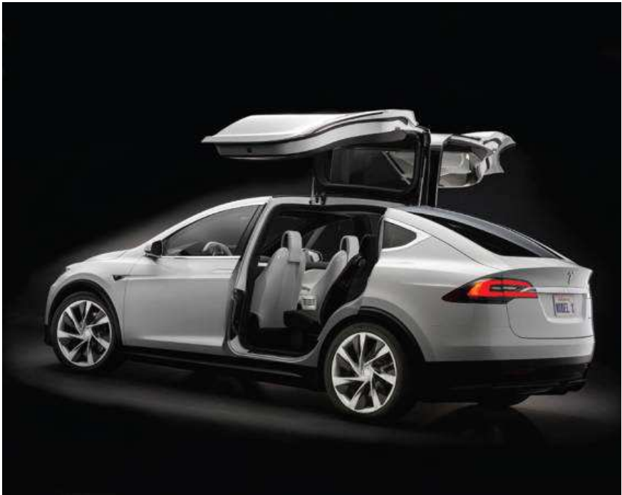
Tesla's next car will be the Model X SUV with its signature "falcon-wing doors."