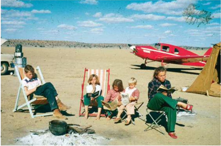
The Haldeman children had lots of downtime in the African bush while on wild adventures with their parents.