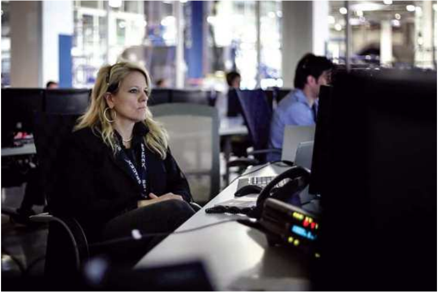
Gwynne Shotwell is Musk's right-hand woman at SpaceX and oversees the day-to-day operations of the company, including monitoring a launch from mission control.