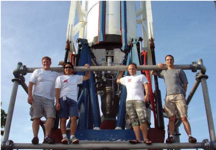
Tom Mueller ( far right, gray shirt ) led the design, testing, and construction of SpaceX's engines.