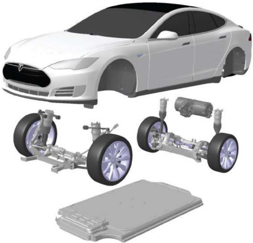
The Tesla Model S sedan with its electric motor ( near the rear ) and battery pack ( bottom ) exposed.