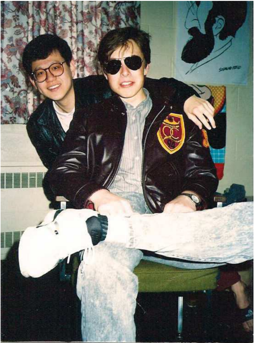
Musk ran away on his own to Canada and ended up at Queen's University in Ontario, living in a dormitory for foreign students.