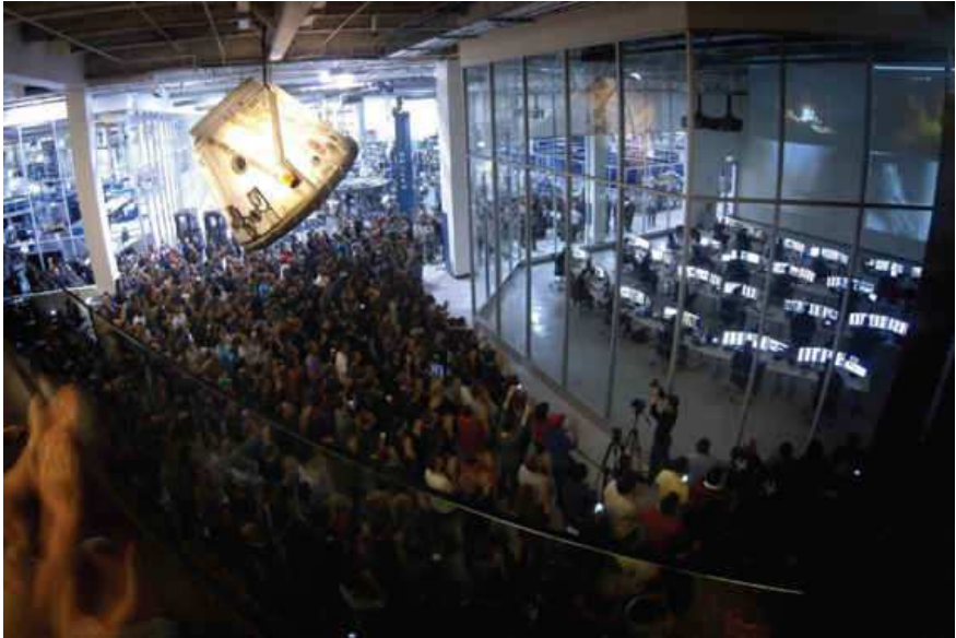
With a Dragon capsule hanging overhead, SpaceX employees peer into the company's mission control center at the Hawthorne factory.