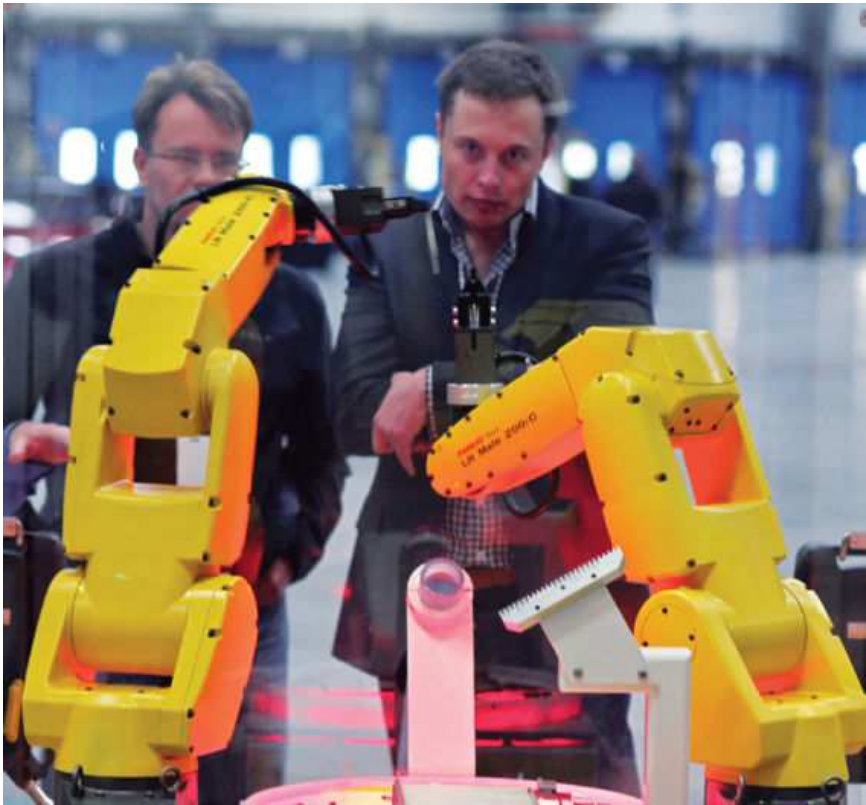
Musk has long had a thing for robots and is always evaluating new machines for both the SpaceX and Tesla factories.