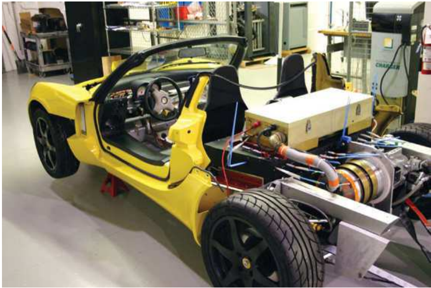
A handful of engineers built the first Tesla Roadster in a Silicon Valley warehouse that they had turned into a garage workshop and research lab.