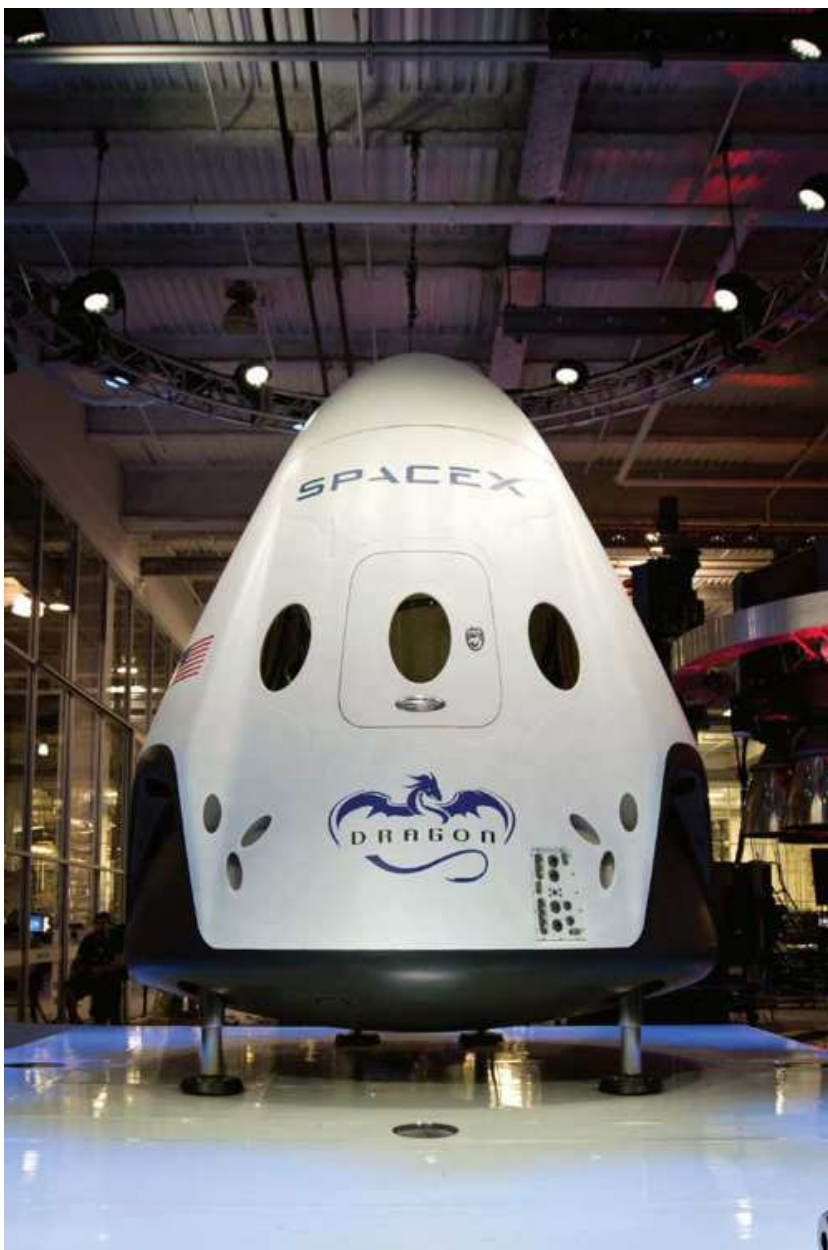
The Dragon V2 will be able to return to Earth and land with pinpoint accuracy.