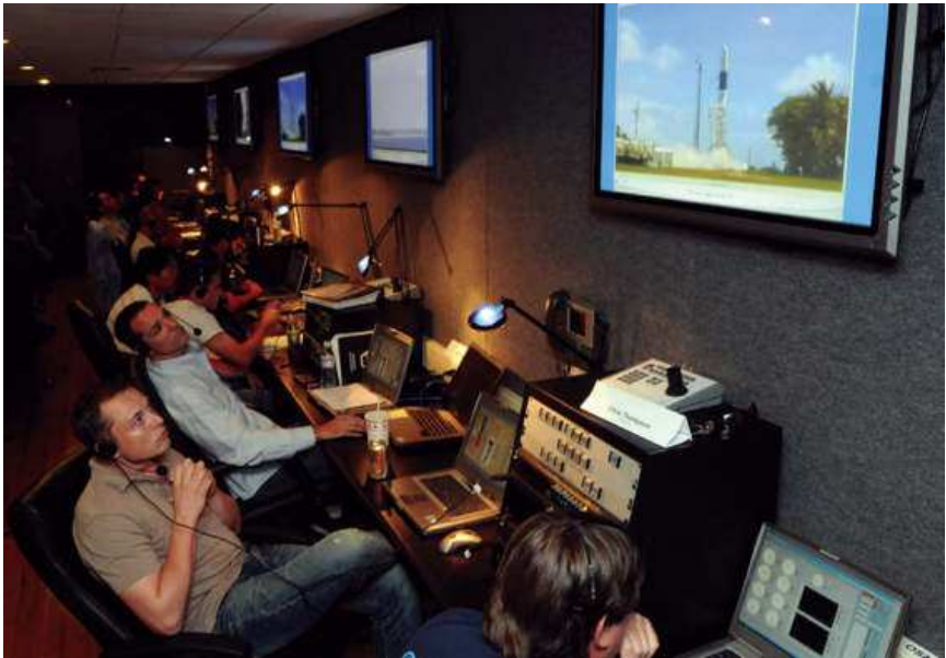
SpaceX built a mobile mission-control trailer, and Musk and Mueller used it to monitor the later launches from Kwaj.