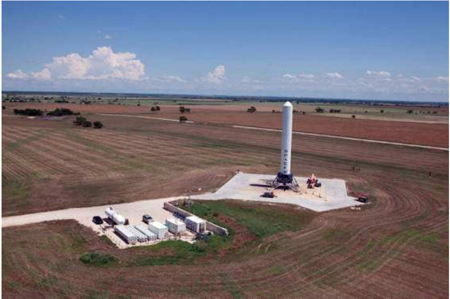
SpaceX tests new engines and crafts at a site in McGregor, Texas. Here the company is testing a reusable rocket, code-named "Grasshopper," that can land itself.