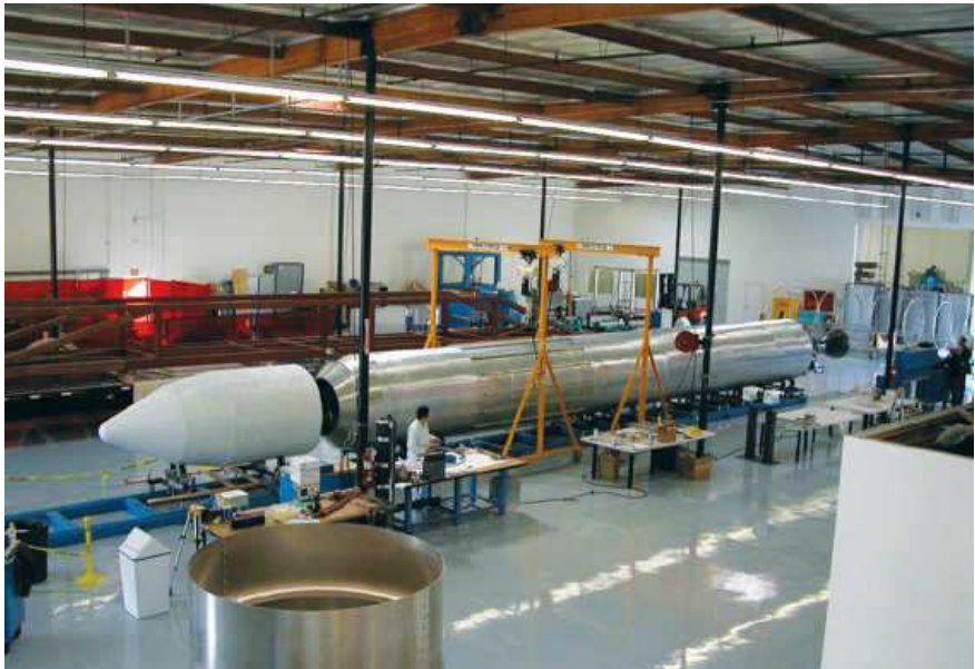
SpaceX built its rocket factory from the ground up in a Los Angeles warehouse to give birth to the Falcon 1 rocket.