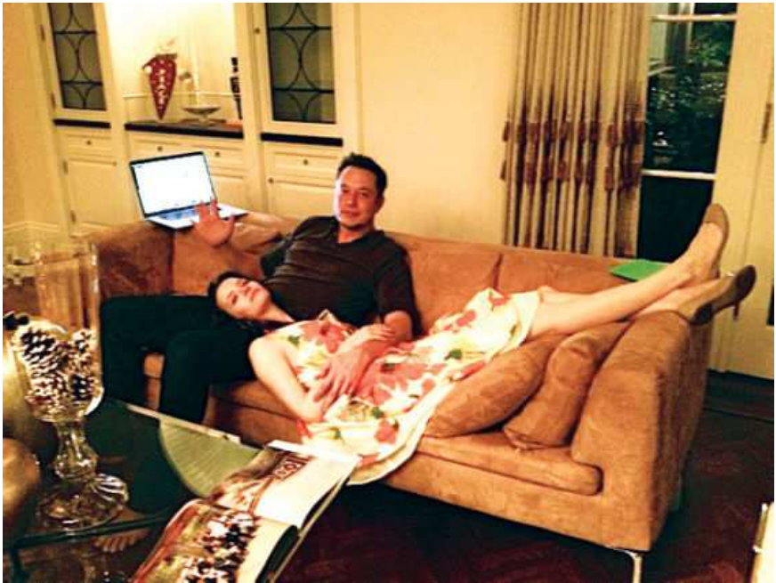
Musk and Riley relax at home in Los Angeles. Musk shares the home with his five young boys.