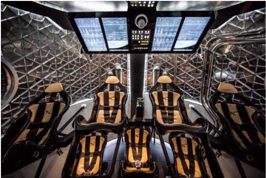
In 2014, Musk unveiled a radical new take on the space capsule—the Dragon V2. It comes with a drop-down touch-screen display and slick interior.